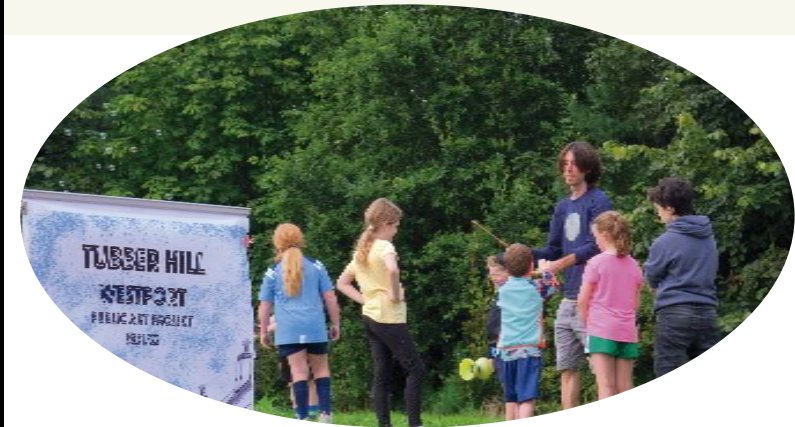
A series of ongoing collaborations: open days, poetry, writing, making, visual art, circus skills, rap and rhyme.