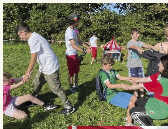
Residents taking part in circus skills workshop with Finn and Bruna Little Top Stars Circus.