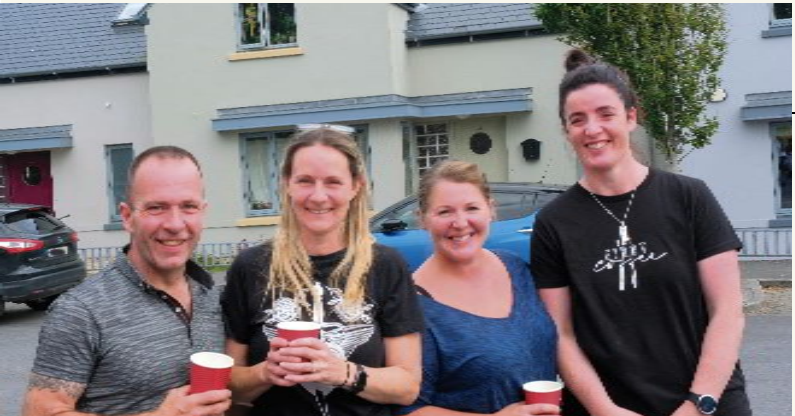
Tubber hill residents enjoying open day on the green.