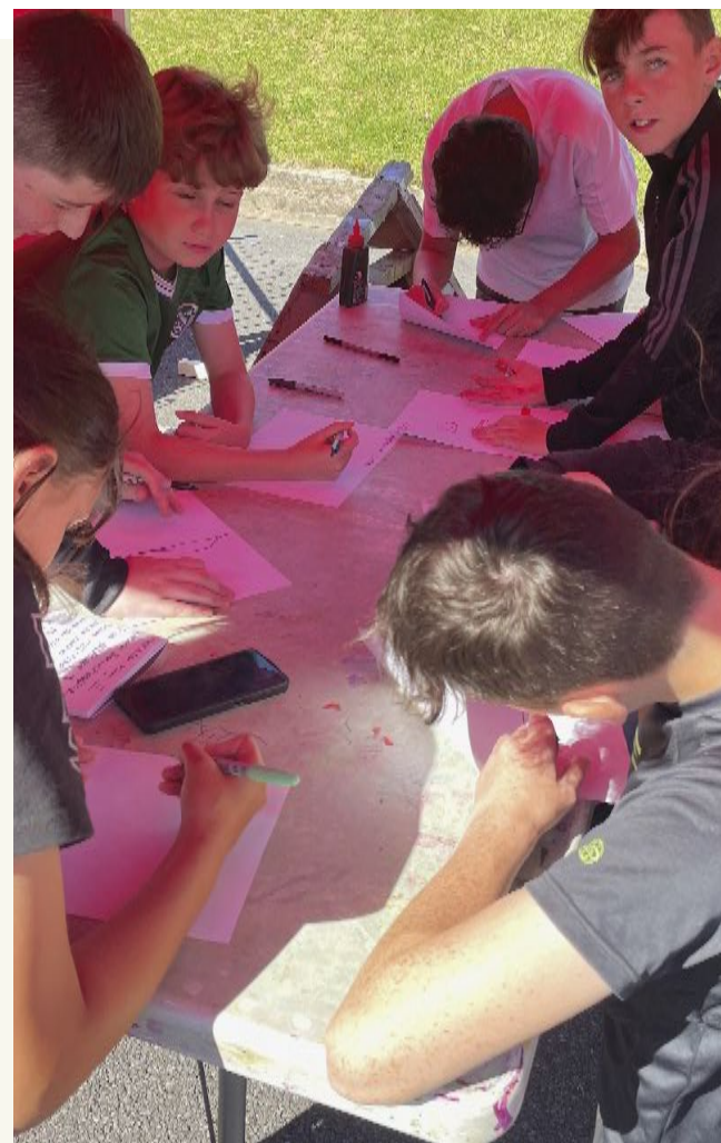
Participants developed a 3d drawing to create a skate ramp