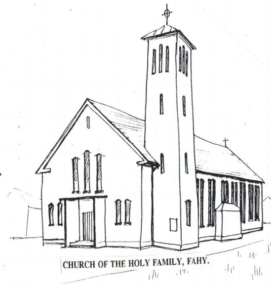
CHURCH OF THE HOLY FAMILY, FAHY.

In this Sunday's gospel Jesus raises Lazarus from the dead and shows that he is Lord of the living and the dead.