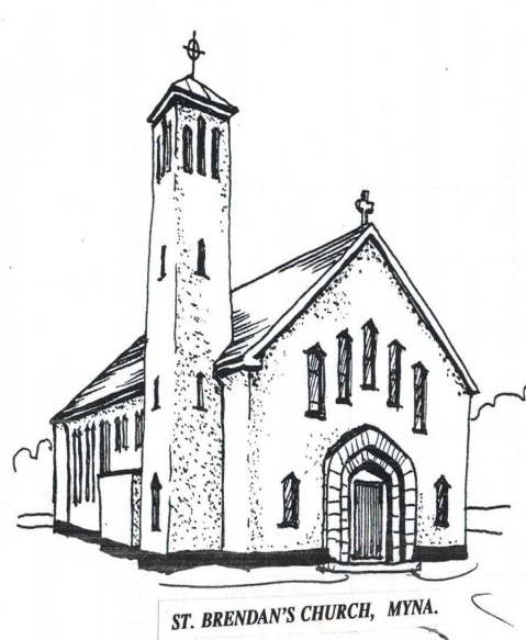
ST. BRENDAN'S CHURCH, MYNA.