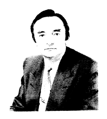
Padraig Flynn, T.D., Minister for the Environment