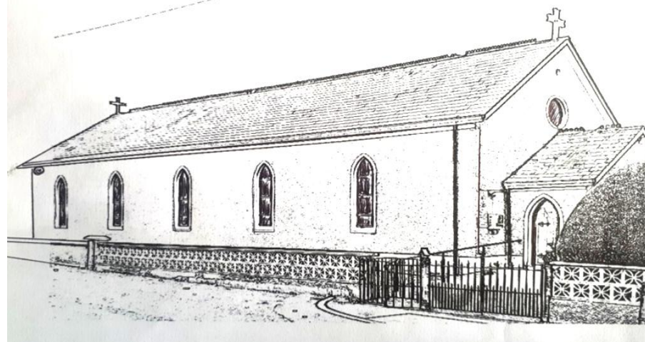
Holy Rosary Church, Glenisland

"Here is a teaching that is new and with authority behind it; He gives orders even to unclean spirits and they obey him."