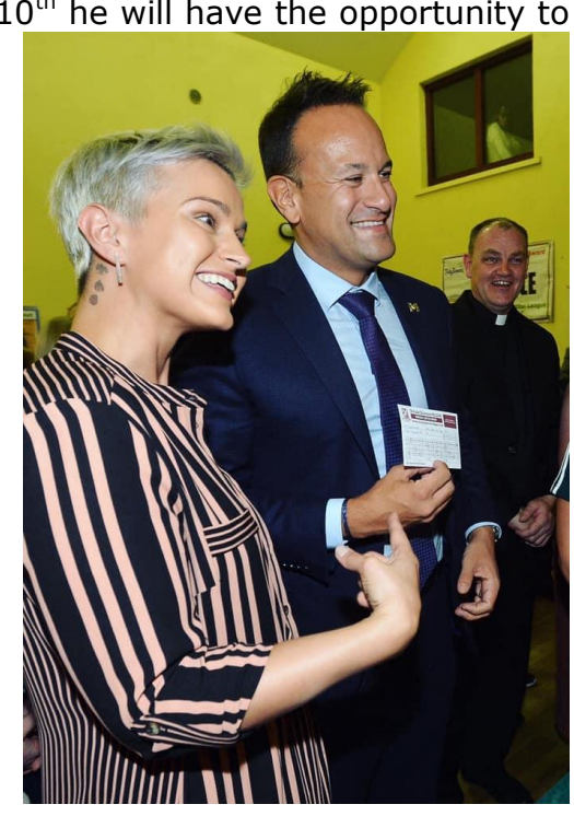
The MEP. The VIP and the PP

see firsthand the great work that is being done by the various community groups and it's all on a voluntary basis. Glencorrib Community Sportsfield Trustees and development committee, Glencorrib NS construction of a new classroom, more recently the Community Centre having been approved for a €25,000 new heating and insulation project, the RSS team who maintains grass and footpaths etc and keeps the church clean and tidy, Glencorrib Village Enhancement and the various other groups and individuals that maintains our community. We also have to acknowledge the great support that we have received from the people in the Shrule side of the parish. So on Thursday next, An Taoiseach Leo Varadkar along with Marie Walsh MEP and local county councillors will arrive in Glencorrib at approx 1pm. Kathleen Shaughnessy and the team are organising a cuppa tea for the group in the community centre where they will meet the locals followed by a walkabout visit to Sunny Days (breakfast club and after school service club), Glencorrib Kilroe Community Sportsfield and walkway and Glencorrib NS. Truly we have a great community and a great community spirit, so let's all build on that. Hope to see you all on Thur next 10<sup>th</sup> Aug @ 1pm. More details in online newsletter.