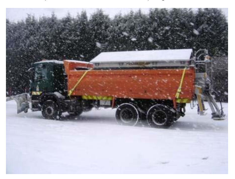
Figure 4: Demountable salt spreader

The spreaders are generally the demountable type with the 9 & 6m³ mounted on machinery yard trucks and the 2m³ mounted on Area pick-ups. The trucks carrying the 9 & 6m³ salt spreaders can also be fitted with ploughs for snow clearance when required.