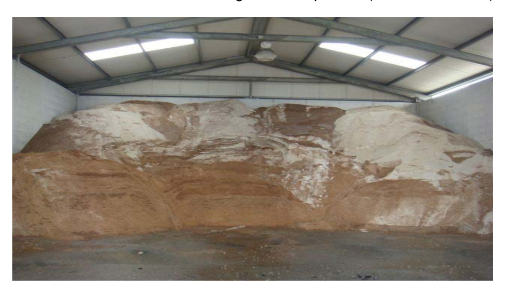
Figure 5: Salt storage barn

Salt will be stored in barns (Ballina, Castlebar, Claremorris & Kilkelly) or other designated indoor storage sheds (Ballinrobe & Westport) where possible. Otherwise salt should be stored outdoors in designated compounds (Achill & Belmullet).