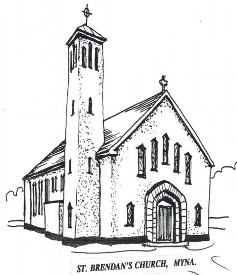
ST. BRENDAN'S CHURCH, MYNA.