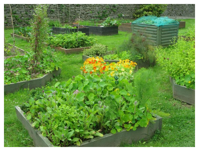
Ballinrobe Community Garden

Ballinrobe has a considerable built heritage with the Augustinian Abbey, old graveyards, the Library, Cranmore House etc. Old buildings, graveyards and stone structures are often refuges for wildlife as they can be relatively undisturbed and have been present for a long time. A heritage walk has been developed to highlight this wonderful heritage.