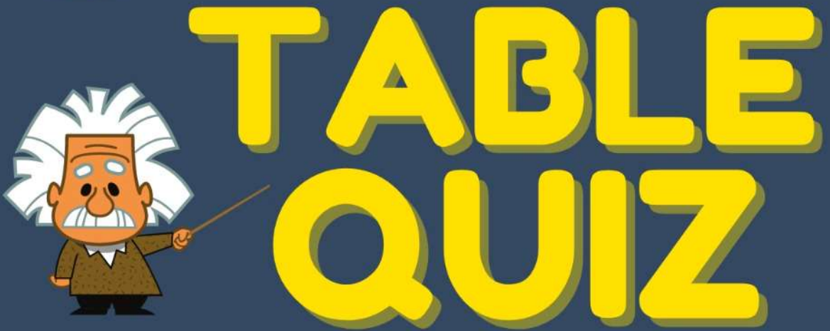
TABLE QUIZ PRIZES, RAFFLE, SPOT PRIZES ON THE NIGHT

1ST PRIZE €100 FOR WINNING TABLE - SPONSORED BY MCGAUGHS GARDENING COMPLEX