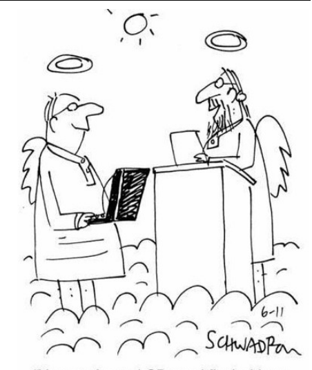
"You won't need CDs and flash drives here—everything is stored in the cloud."

"Being a parent means never buying the right amount of produce. Either everyone suddenly loves grapes and a week's worth are eaten in one afternoon, or fruit flies are congregating around my rotting bananas."