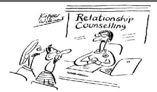
"I'm not saying we aren't getting on but she's applied to join NATO.'

Your support with this annual fundraiser is greatly appreciated. Please share the link far and wide!