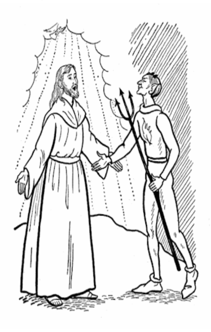
"Repent, and believe the good news."

Sunday 18<sup>th</sup> Feb 2024 – 1<sup>st</sup> Sun of Lent