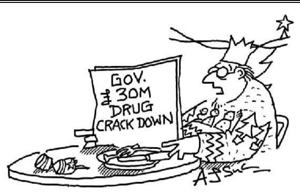
"That's all we need at this time of year — more cold turkey."