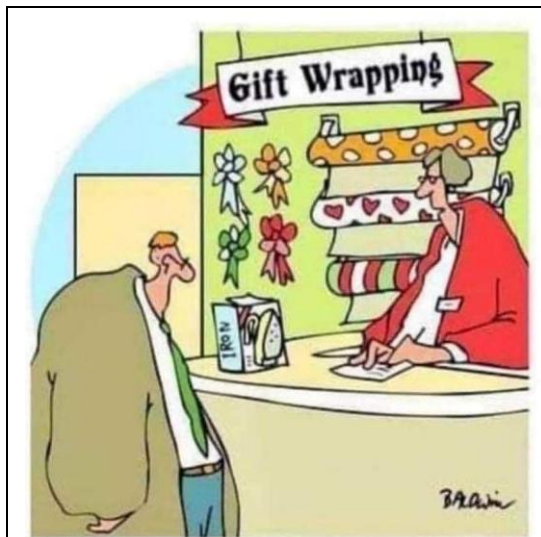
"Nice iron. Your wife will love it. While I wrap it, you might want to go over to sporting goods and pick out a helmet."

On behalf of our community we would like to thank all those community groups and individuals who have worked so hard over the past few years to complete several of these projects which has enhanced our Community and made it a much more safer and attractive place to live in and to visit.