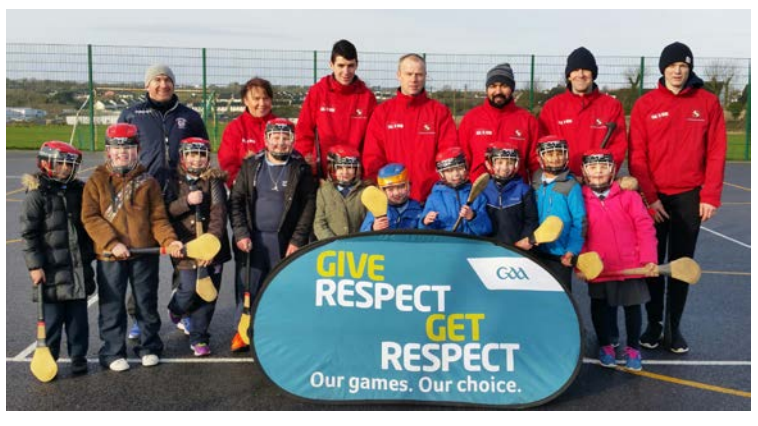
PIC: Ballyhaunis Goal2Work Sports Coaches on placement in local Primary Schools.