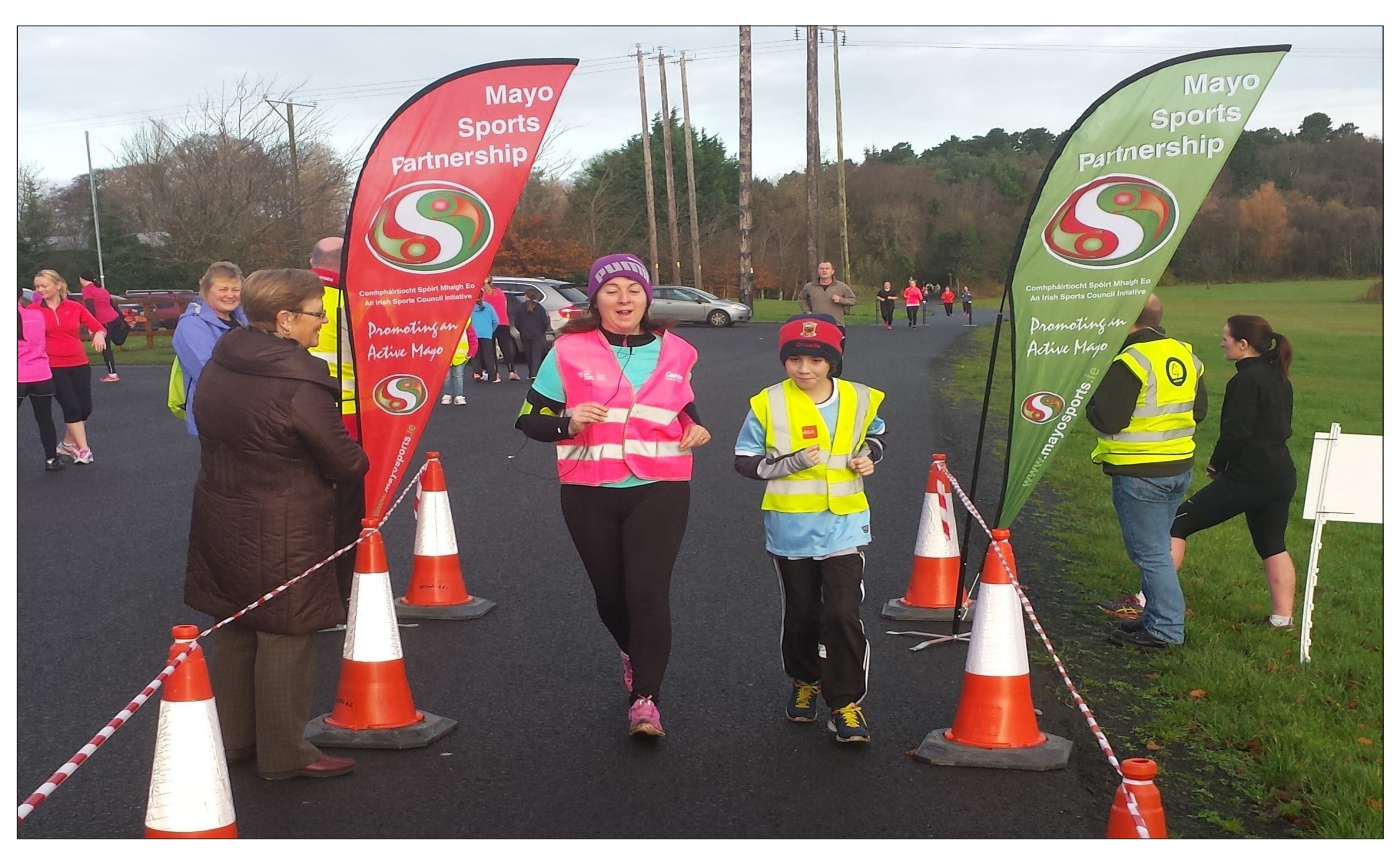
Ballina parkrun was launched in November 2014