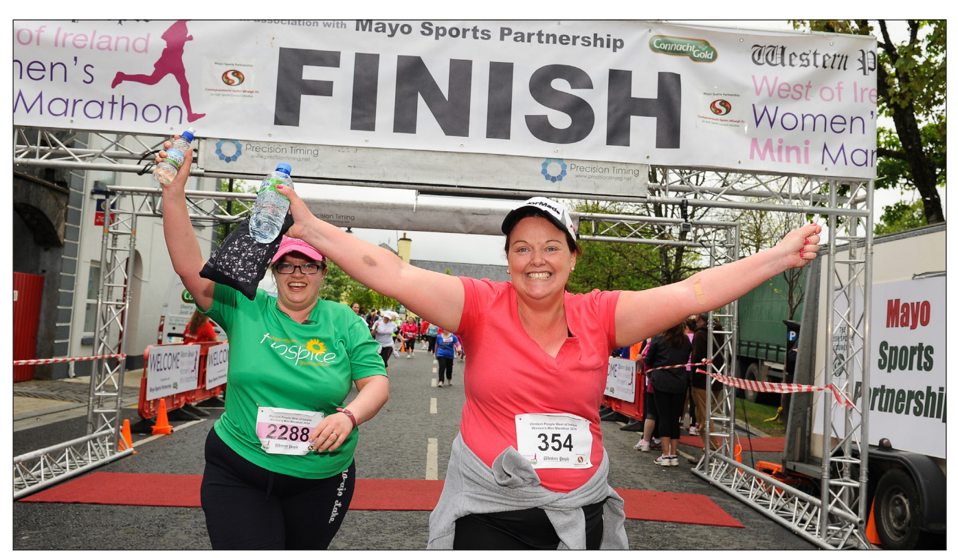
5th West of Ireland Women's Mini Marathon

MSP plays a key role in providing opportunities for those people who may not have direct access to organized sport or physical activity. MSP creates programmes that will help break down these barriers for the minority groups that might be affected i.e. people with disabilities.