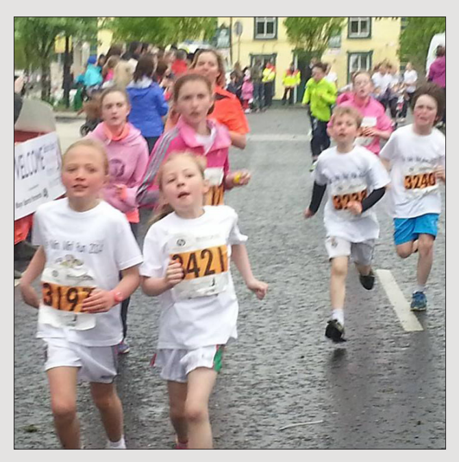
Pics: Participants at the start of the Childrens Mini Mini Run in May 2014