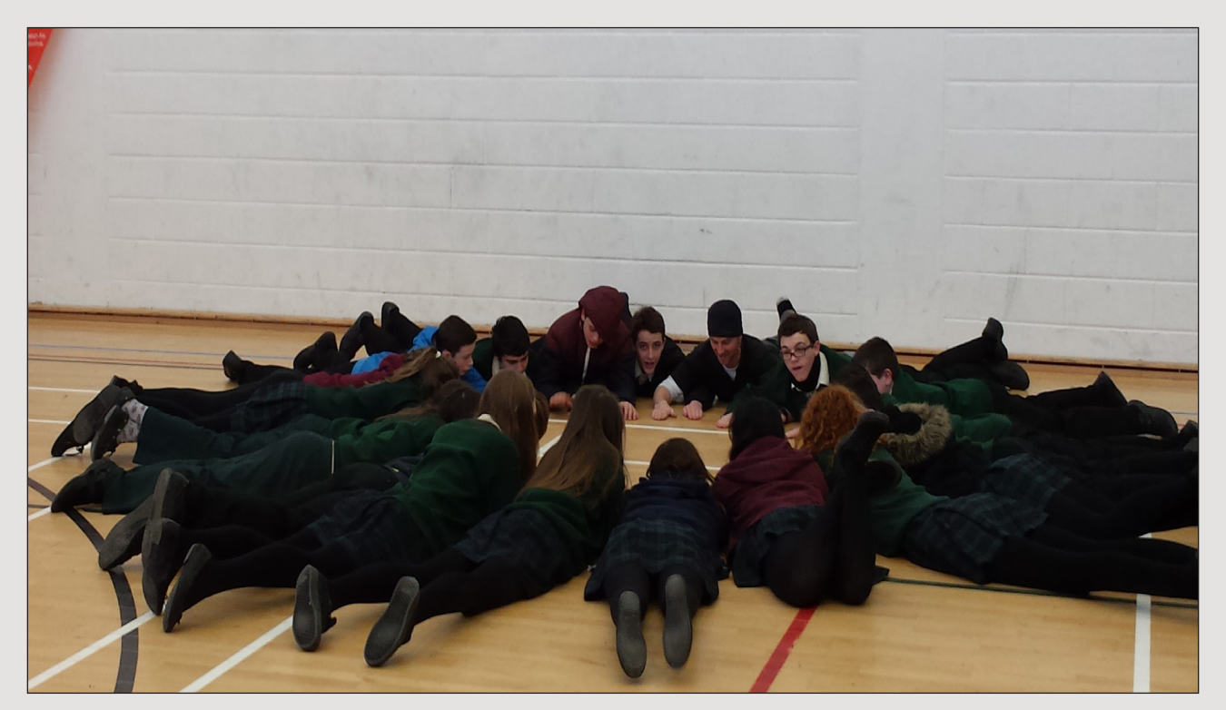
Davitt College students participating in the healthy living programme