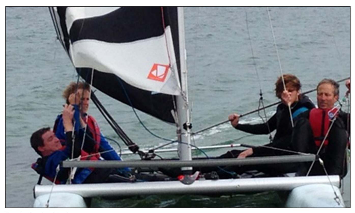
Erris Outdoor Disability Day