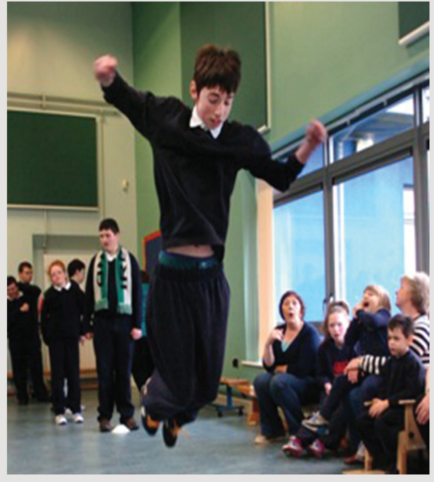
Pics: Teachers and Children of St Dymphnas Ballina who participated in the Sportshall Athletics programme