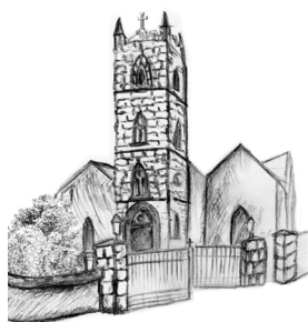
Church of St. John the Baptist, Knock