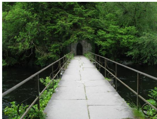
Entrance to Cong Woods from village

Located between Lough Mask and Lough Corrib, the Cong area is a haven for nature and wildlife. Both Lough Mask and Lough Corrib are designated for nature conservation as Special Areas of Conservation (SAC) and Special Protection Areas (SPA). Lough Corrib is one of the country’s top ornithological sites and supports large numbers of wintering waterfowl such as Greenland White-fronted Geese and Golden Plover. It also has extensive wetland habitats, which are important feeding and nesting grounds for birds. Lough Corrib also supports other important species such as Salmon, Otter, White-clawed Crayfish and Lamprey. Lough Mask is also important for wintering waterfowl and in summer for breeding gulls such as Black-headed Gull, Common Gull and Black Back Gull. Lough Mask has an extensive shoreline with limestone pavement, scrub and fens. Lough Mask feeds into Lough Corrib, mostly through underground waterways and the Cong River.