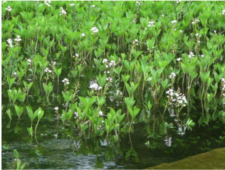
Bog-bean in flower on the Cong River.

Black-headed Gull with flower meadow in background