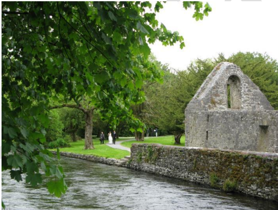
View of Cong Abbey

Cong is a beautiful village in south Mayo. Completely surrounded by water, the village is an island set in a limestone landscape between the great lakes of Lough Mask to the north and Lough Corrib to the south. The Cong area is one of outstanding beauty with its mix of forest, limestone and water, history and heritage. Many land and water-based natural amenities can be enjoyed in and around Cong- fishing, boating, walking and exploring. Cong is an angler's paradise with Lough Mask and Lough Corrib, both renowned for Salmon and Trout fishing, and the Cong River. The village and surrounding area also has a particularly rich built heritage with the Abbey, Mill, Dry Canal, Ashford Castle and Estate. Cong has attracted international fame for its association with 'The Quiet Man' film starring John Wayne and Maureen O'Hara.