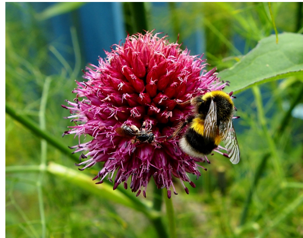
Presented by Mayo County Council Heritage Office, in association with Frogswell Nursery.