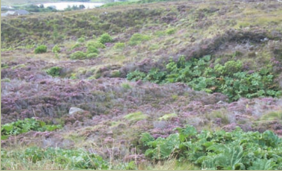
Gunnera tinctoria growing between heather and along a river.

In the west of Ireland, Gunnera is predominant along roadsides and waterways, on coastal cliffs and disused farmlands and quarries.