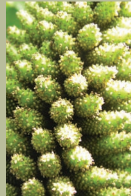
Large fruiting head in flower (left). seeds (right). Seeds turn red/orange when ripe.