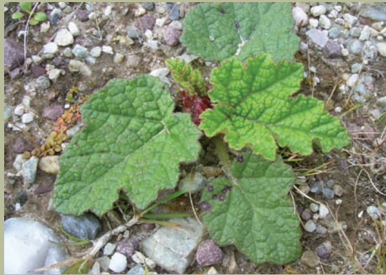
Gunnera tinctoria seedling growing in gravel